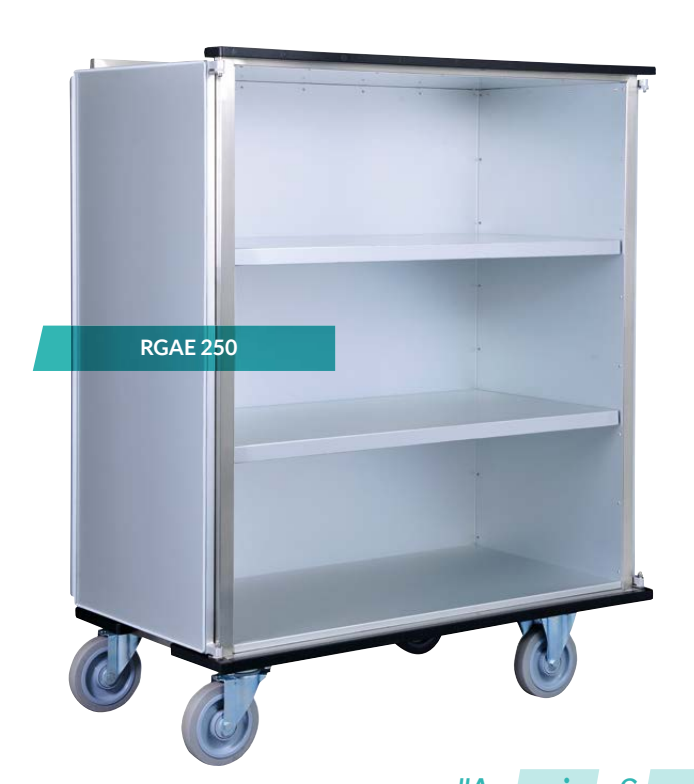
"Amazing Space! Our RGAE 250 excels in terms of its special depth!"