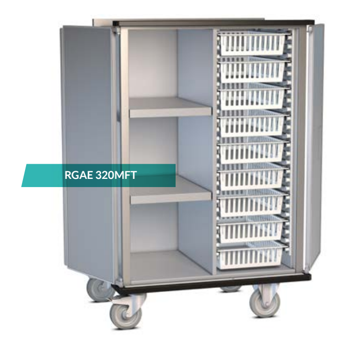
\label{eq:modular-combi-case} \mbox{Modular-combi-case cart with ISO side panels} \\ \mbox{and alu-shelves} \\