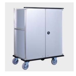
RGAE 250 closed