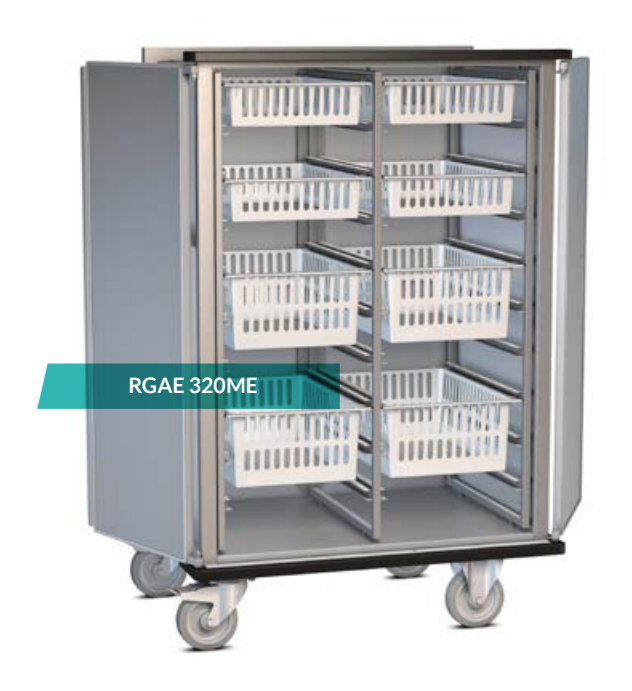
Description and other caster configurations, see page 106!