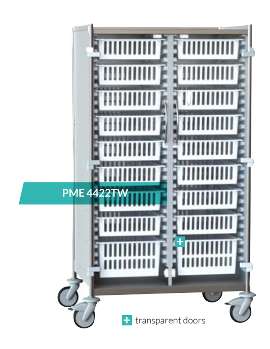
■ Patient care carts PME-series, see chapter patient care from page 38.