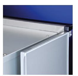
Rubber sealing around the door