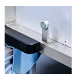
Magnet fixation of doors