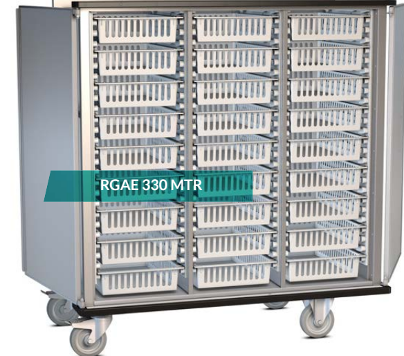
Equipped with ISO trays and HPL shelves (optional)