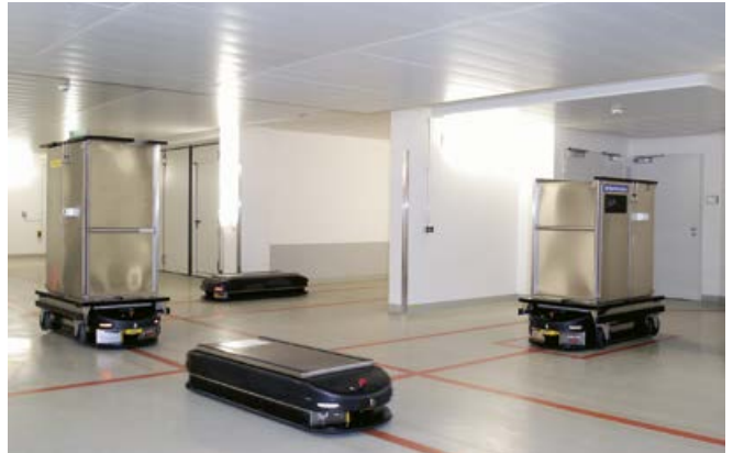
AGV transport units are routed automatically to their destination