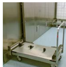
Docking a transfer trolley on the sterilizer