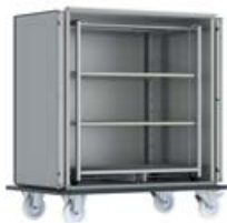
RGE 9SH + EG STE 9 Shuttle rack + height-adjustable wire shelves