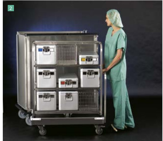
...until it hits the arrester...