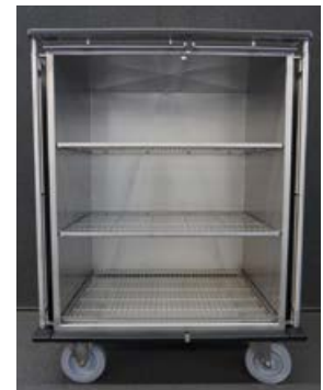
RGEE9FB with wire shelves