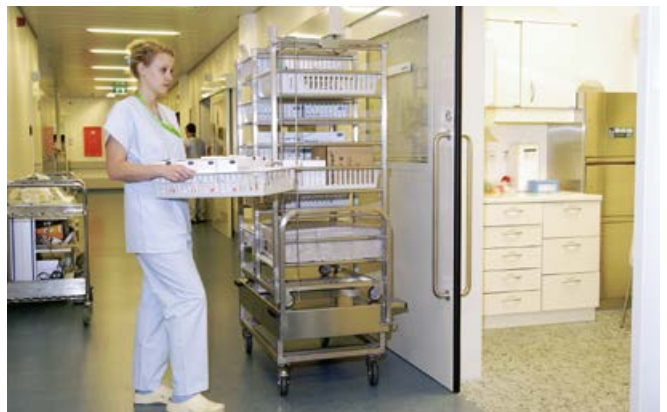
AGV shuttle unit during distribution at the ward