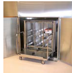
Pass-through cabinet unloading shuttle rack