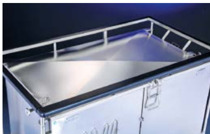
Upper bumper for off-site transport by truck RGEE UOA