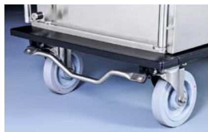
Swivel caster with central brake