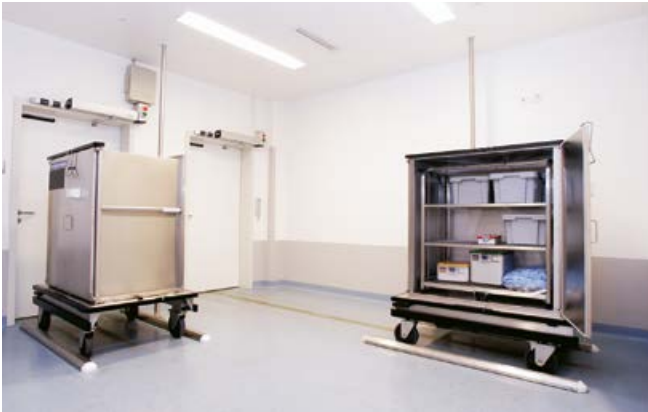
Outgoing goods in the sterilization center