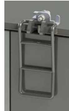
Catch-bolt for added door security, meets the specifications of ADR RGEE HSRR