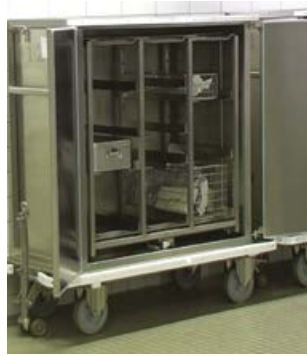
... with all-wheel steering and maneuvering casters