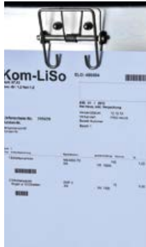
Clamp for papers RGEE KL