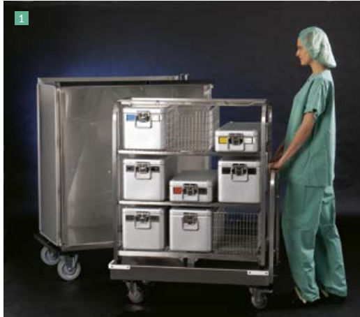
Approach the cart in angular way...

To get the shuttle out of the cart, the steps have to be performed in reverse order. Simply lift the locking bar again and pull the shuttle rack out until it snaps into place on the shuttle cart automatically.