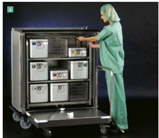
...until it snaps into place.