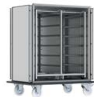
RGE ISO 2SH + 1 piece EG ISO 2 Shuttle rack for ISO modules double row