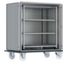
RGEE 9SH + EG STE9 Shuttle rack + height-adjustable wire shelves