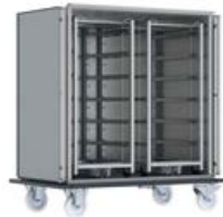
RGEE2XISO1SH + 2 Pieces EG ISO1 Shuttle rack for ISO trays, single row