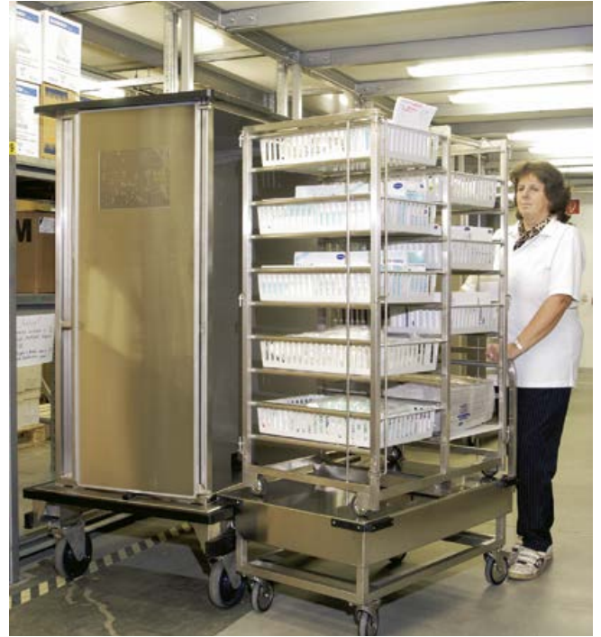
AGV transport cart during assembly at the central store in combination with the Hammerlit-Shuttle-System. Pictures taken at the university hospital in Leipzig, Germany