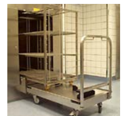
Feeding a two-way shuttle rack into the sterilizer