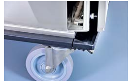
Magnet for door fixation in washing tunnel at 260° RGEE AR260V