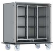
RGE 9SH + EG STE 9E60 Shuttle rack and L-slides