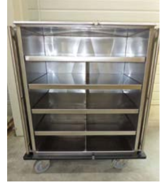
To retain Da Vinci-OT-Robot equipment