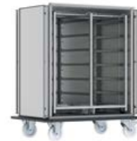
RGEEISO2SH + 1 Piece EG ISO2 Shuttle rack for ISO trays, double row