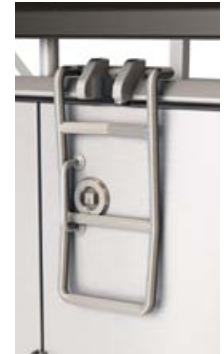
Square-turnable Lock (RGEE HSES) at RGEE. Recommended for cart wash facilities