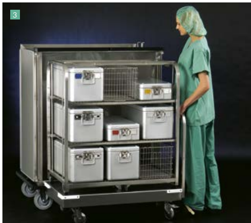
...and shift towards the transport cart. It snaps into place automatically.