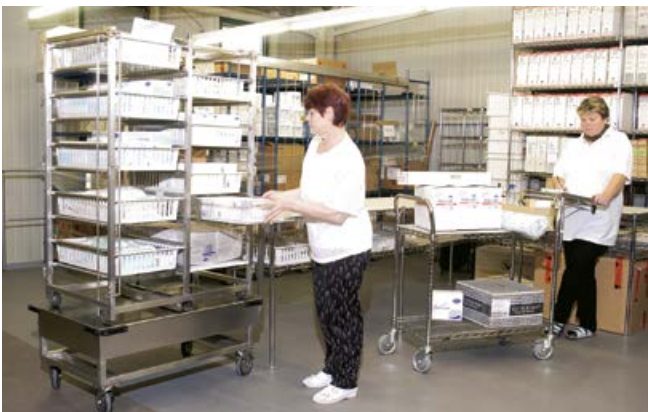
AGV shuttle unit in consignment