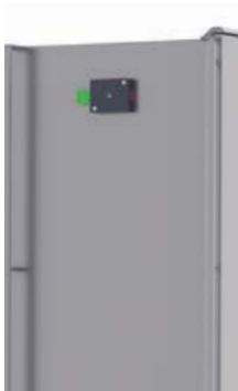
Identification sign RGEE RU (Red/Green)