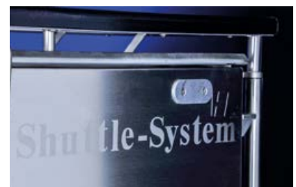
Washing tunnel-resistant labelling as per customer specifications