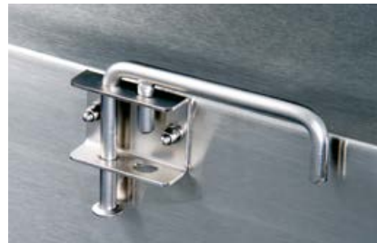
Fold-down bow for door fixation in washing tunnel at 260° RGEE AR260