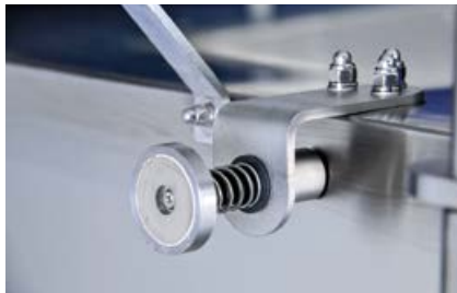
Magnet for door fixation in washing tunnel at 270° and 260° RGEE AR260U