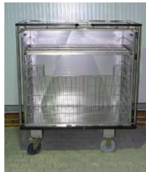
AWT containers with universal wire mesh shelves