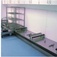
Platform 9STE for 2-way system with valance