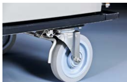
Swivel caster with directional lock