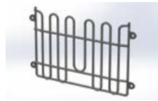
DIN A5 frame for papers CBZ 082