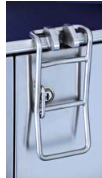
2-point locking system with lock RGEE HS + RGEE HSDS