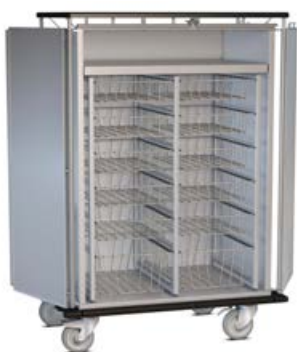
Shuttle rack and perforated shelf