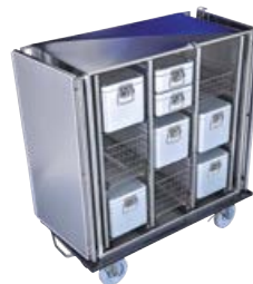
Height adjustable slides CES60T for sterile containers