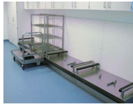
Sterile goods store with elements of Hammerlit Shuttle systems