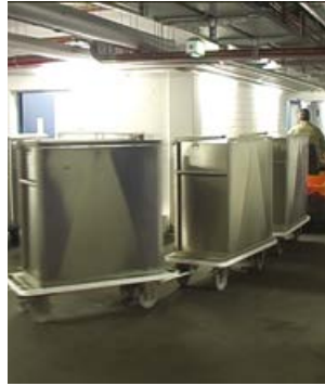
... with all-wheel steering for optimum control