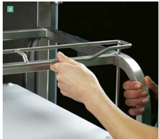
Simply lift the locking bar...