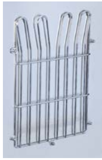
DIN A4 frame for papers CBZ 083