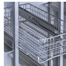
Extension frame for STE baskets and containers CES60AZ2