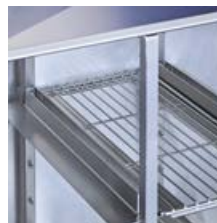
Wire shelf CES60DF