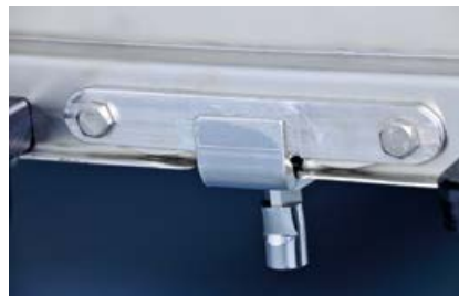
Joint and hitch KD RGEE