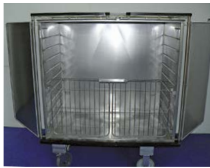
AWT containers with inner doors