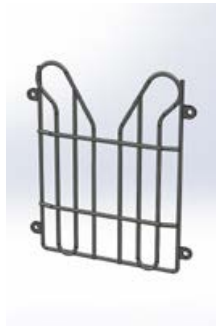
DIN A4 frame for papers CBZ 081