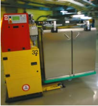
Hammerlit AWT containers

Case carts RGEE and RGAE, stainless steel