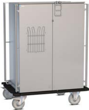
Individual inscriptions applied by the glass bead process

„Manufactured in accordance with your specifications! It may be right for many purposes, but not for every one. That's why we also offer you individual solutions if required.“