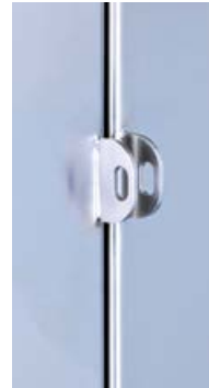
Eyelets for seals RGEE PL