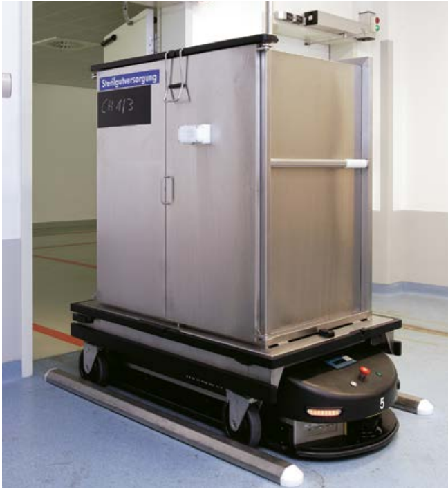
AGV transport cart is collected automatically

Hammerlit is your ideal partner if you are looking for transport carts for Automated Guided Vehicle systems (AGV systems). Whatever the application – whether transport of sterile goods, laundry or waste, ISO-Trays or special containers – we offer customized AGV-compatible solutions.